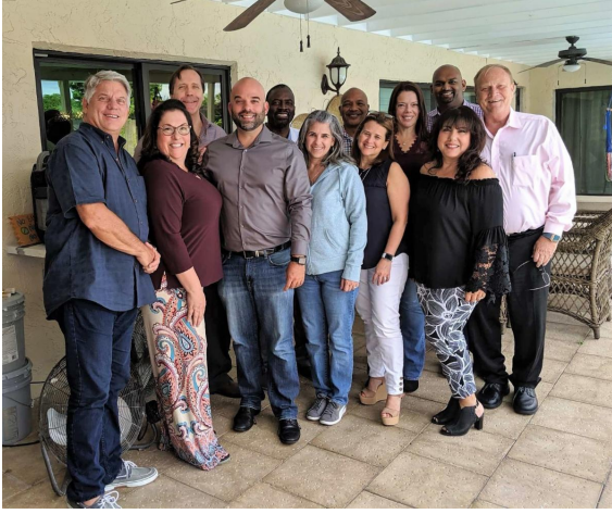
HIMSS Chapter of the Year Award Medium Chapter: South Florida Chapter of HIMSS